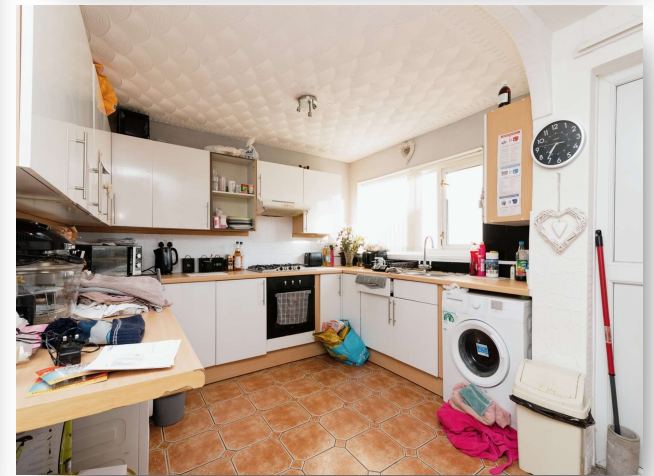
Pennsylvania, Llanedeyrn Cardiff CF23 9LT