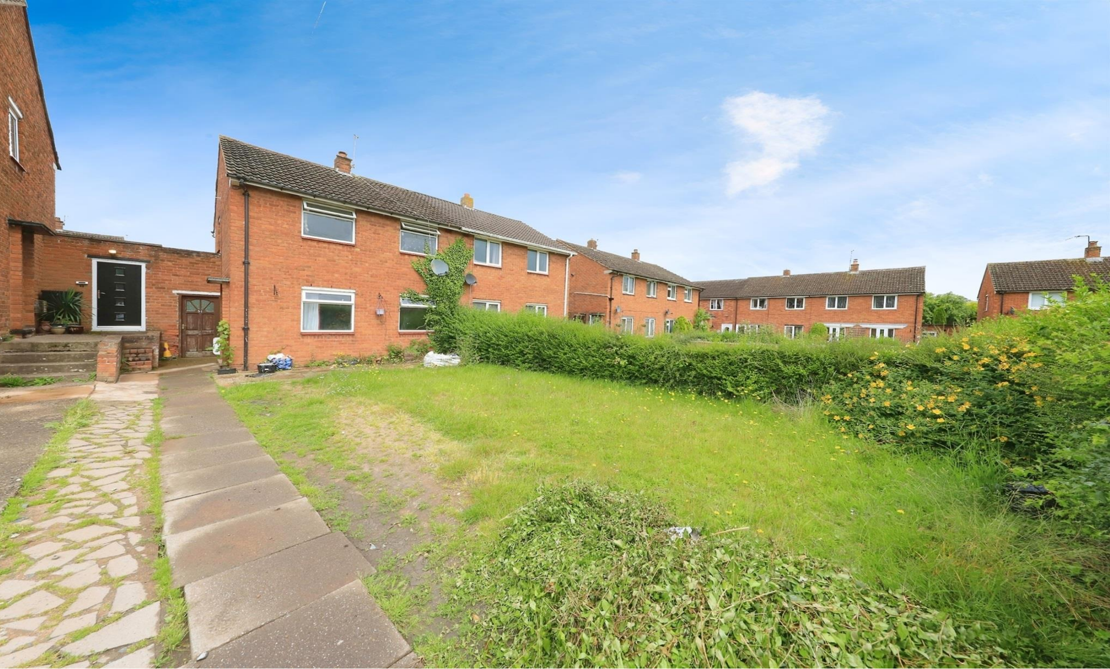
Hermitage Way, Stourport-On-Severn DY13 0DB