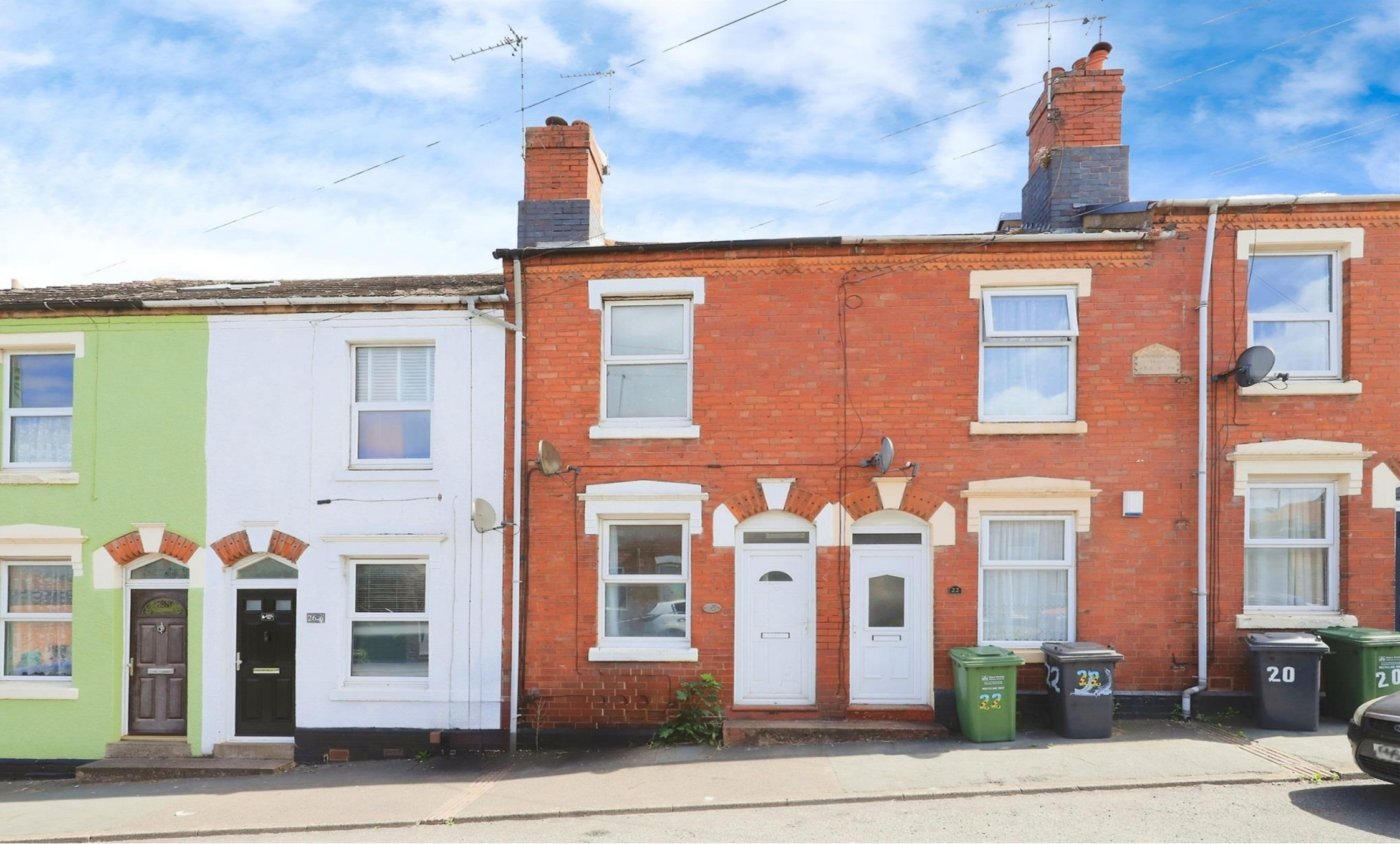
Broad Street, Kidderminster DY10 2LZ