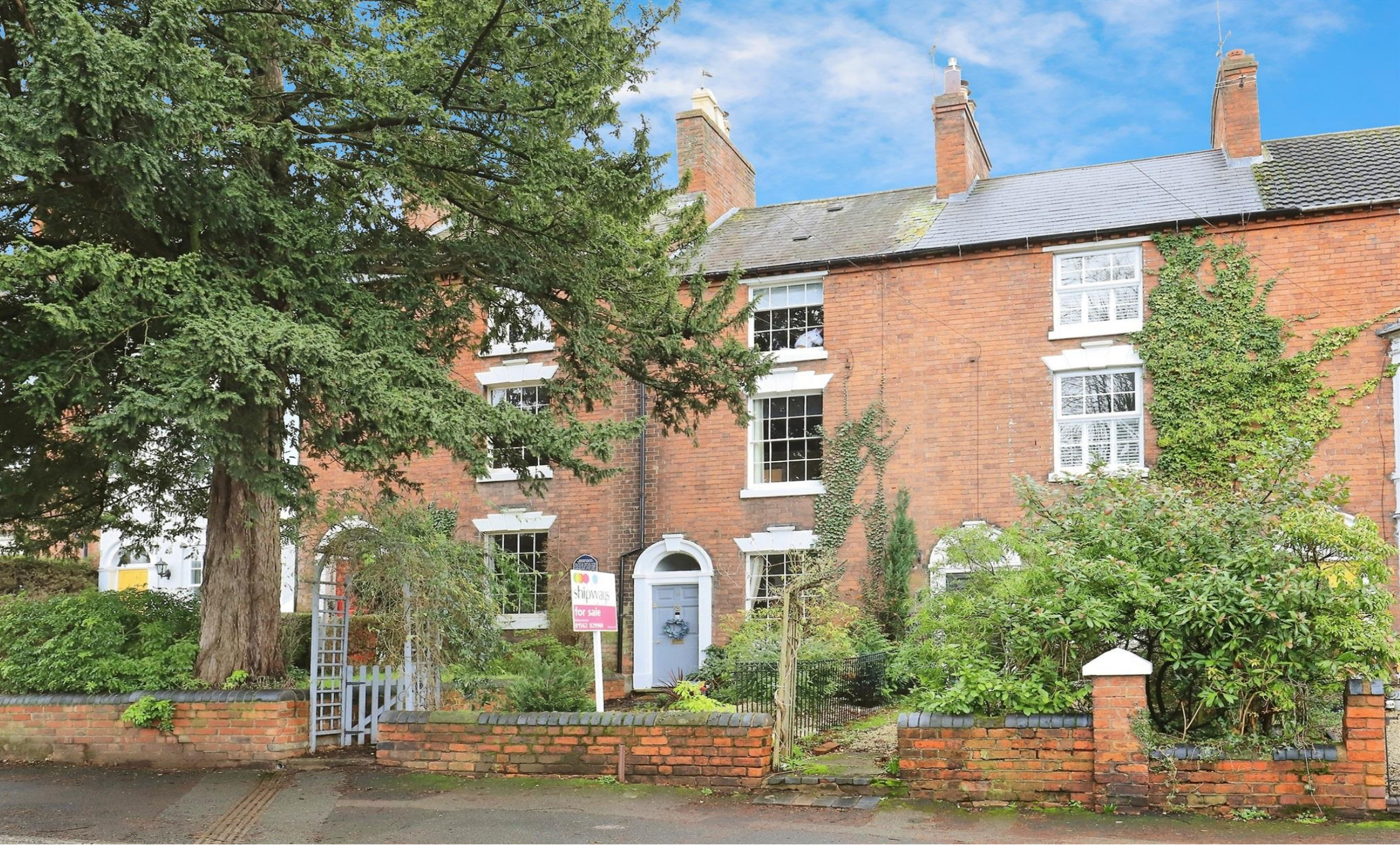
Summer Place, Kidderminster DY11 6QH