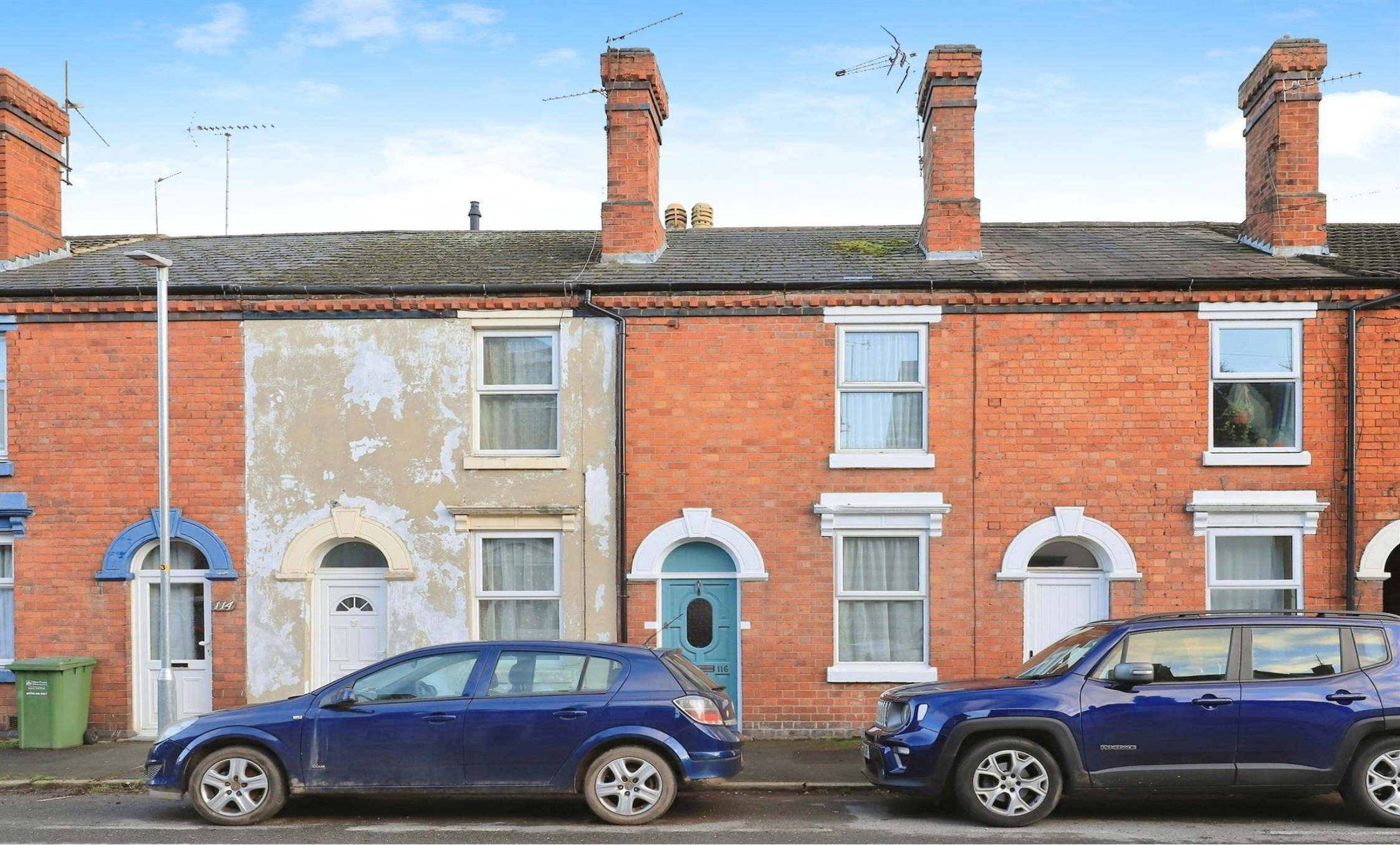
Lorne Street, KIDDERMINSTER DY10 1SY