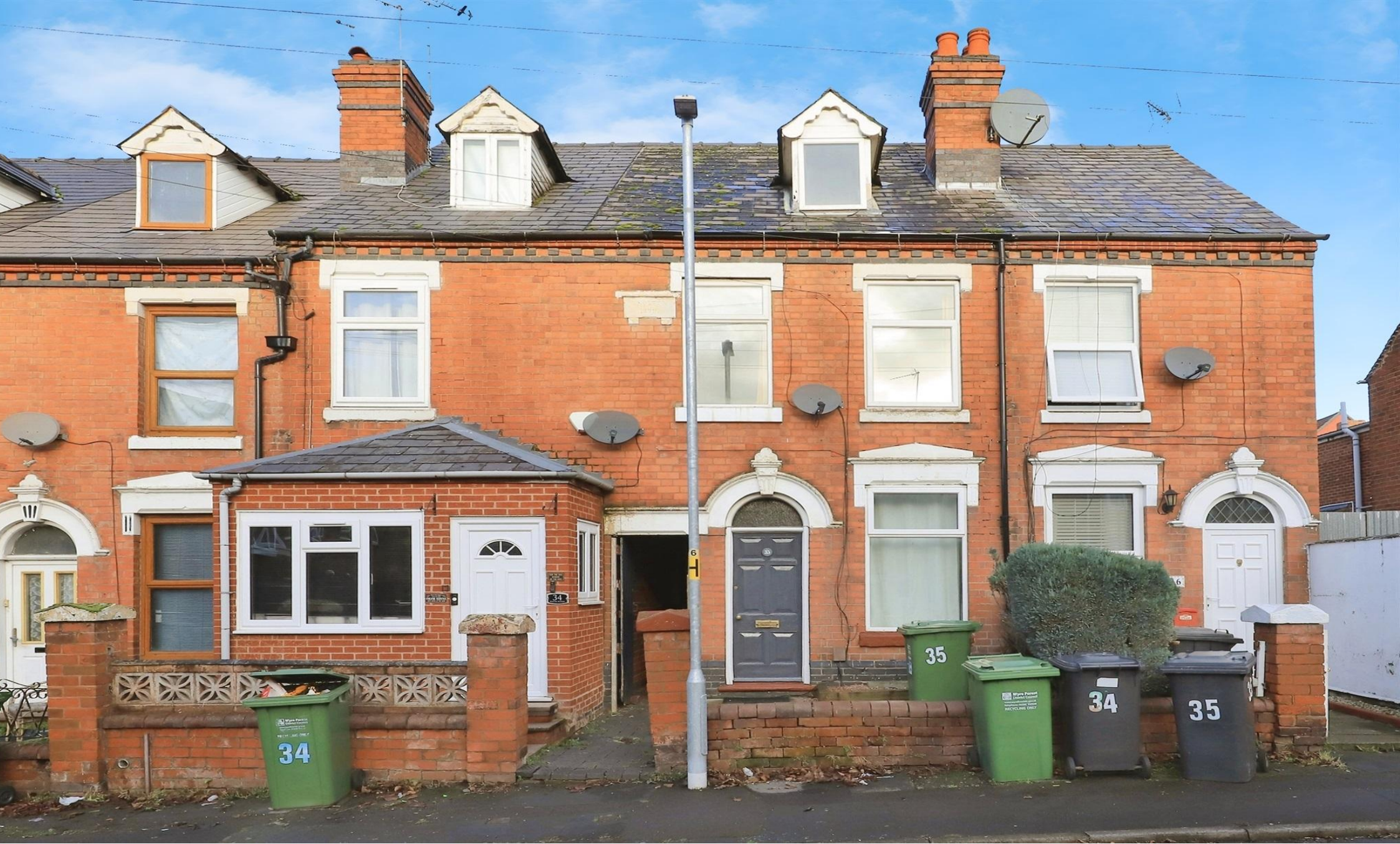
Baxter Avenue, Kidderminster DY10 2EU