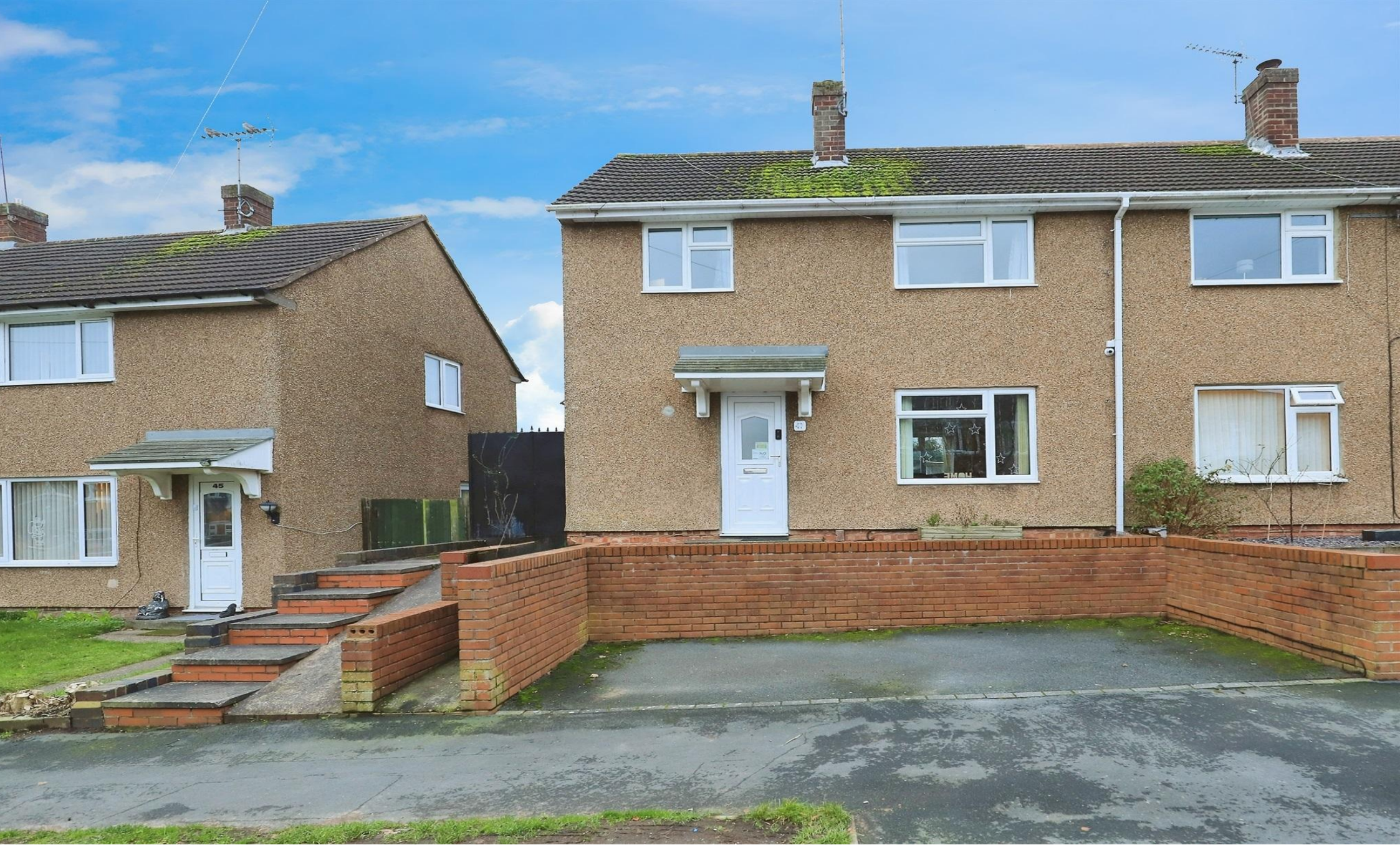
Drake Crescent, KIDDERMINSTER DY11 6EB