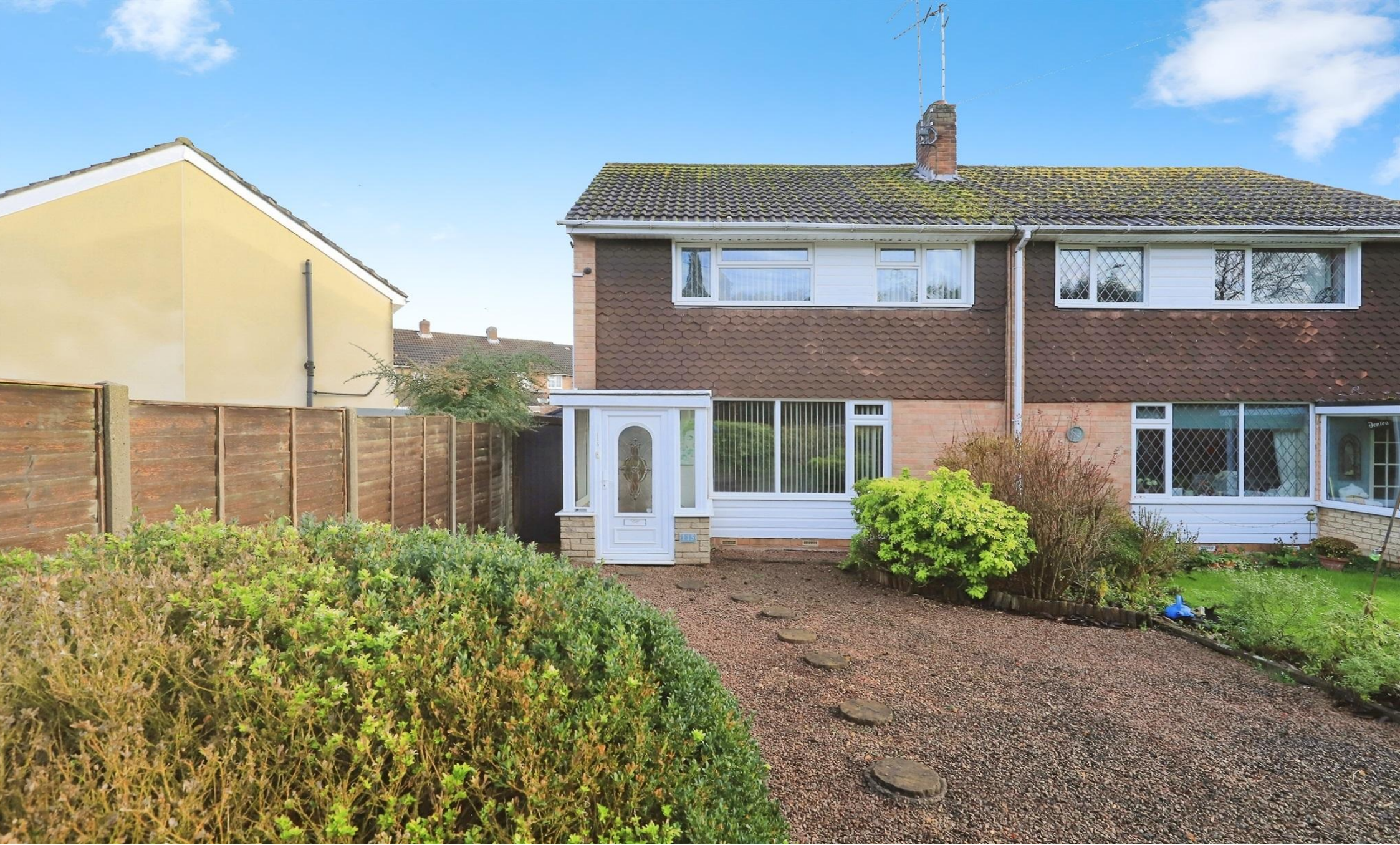
Comberton Road, Kidderminster DY10 3DX