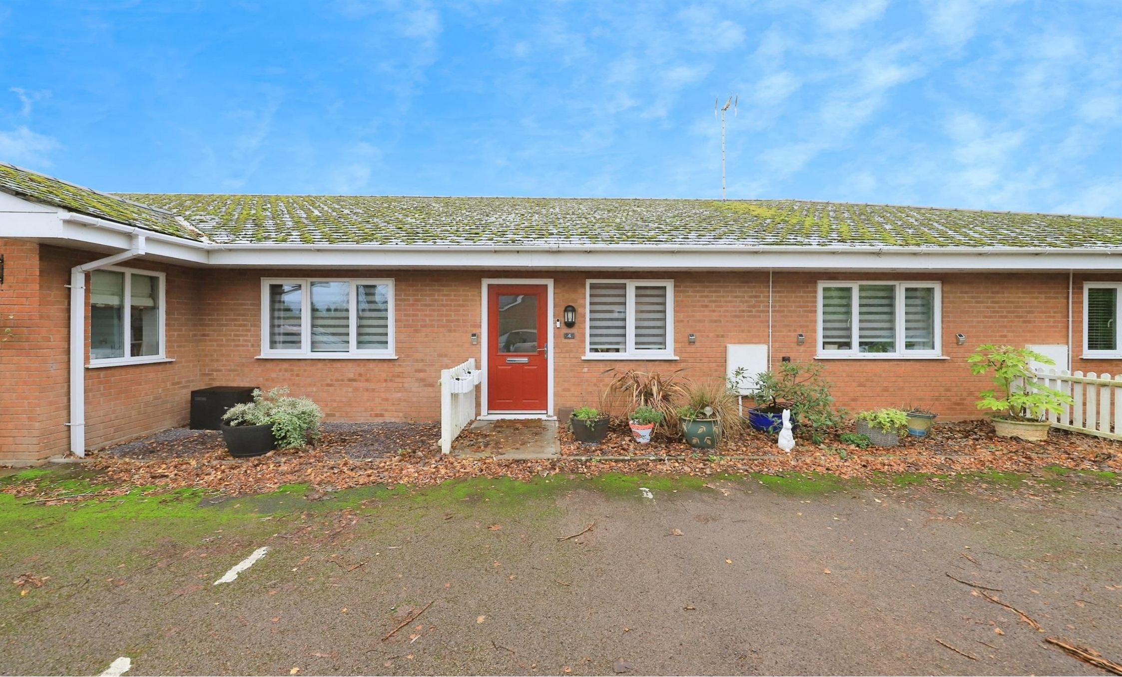
Granary Court, Shenstone Kidderminster DY10 4EZ

Not for marketing purposes INTERNAL USE ONLY