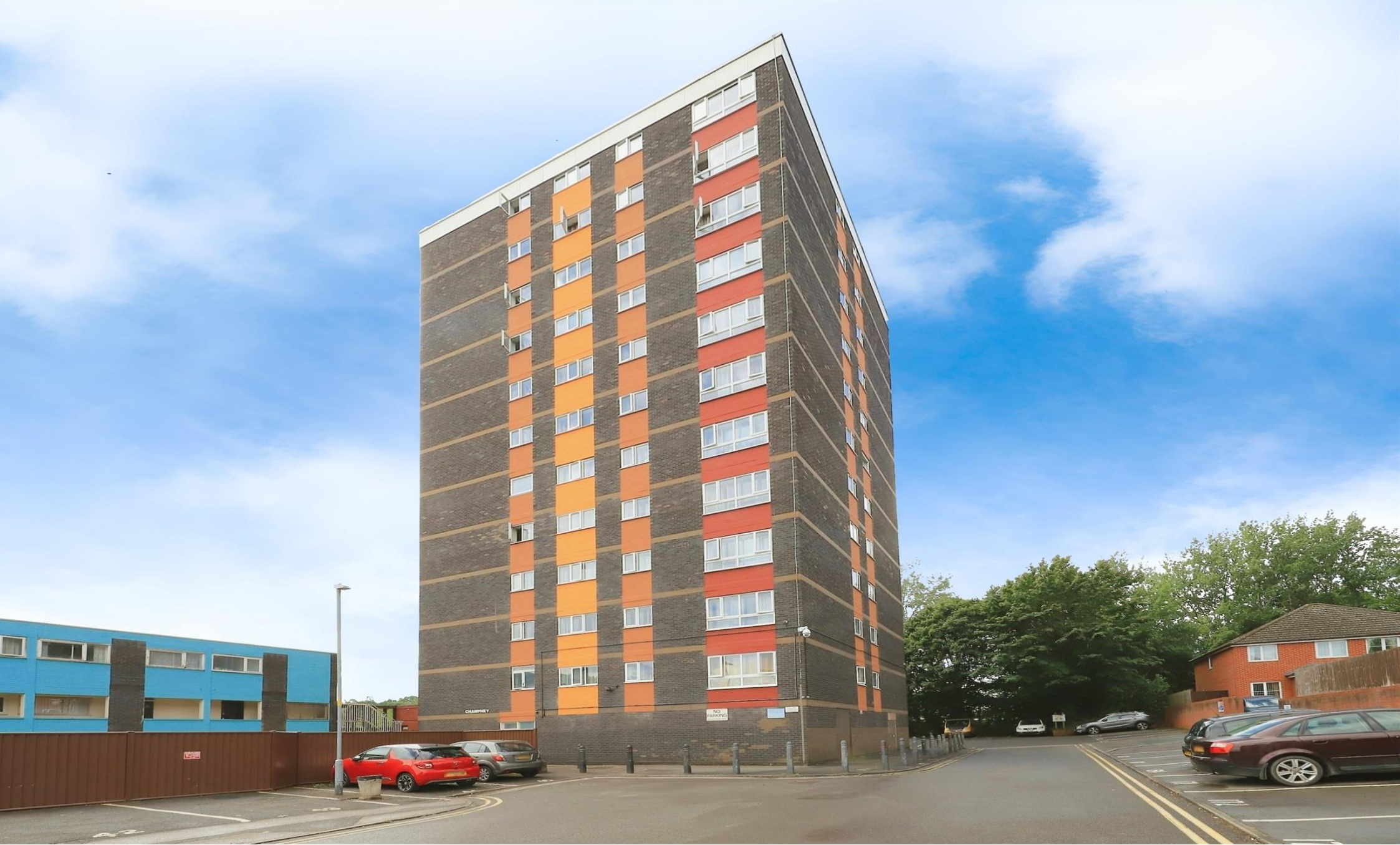
Champney St. Cecilia Close, Kidderminster DY10 1LW