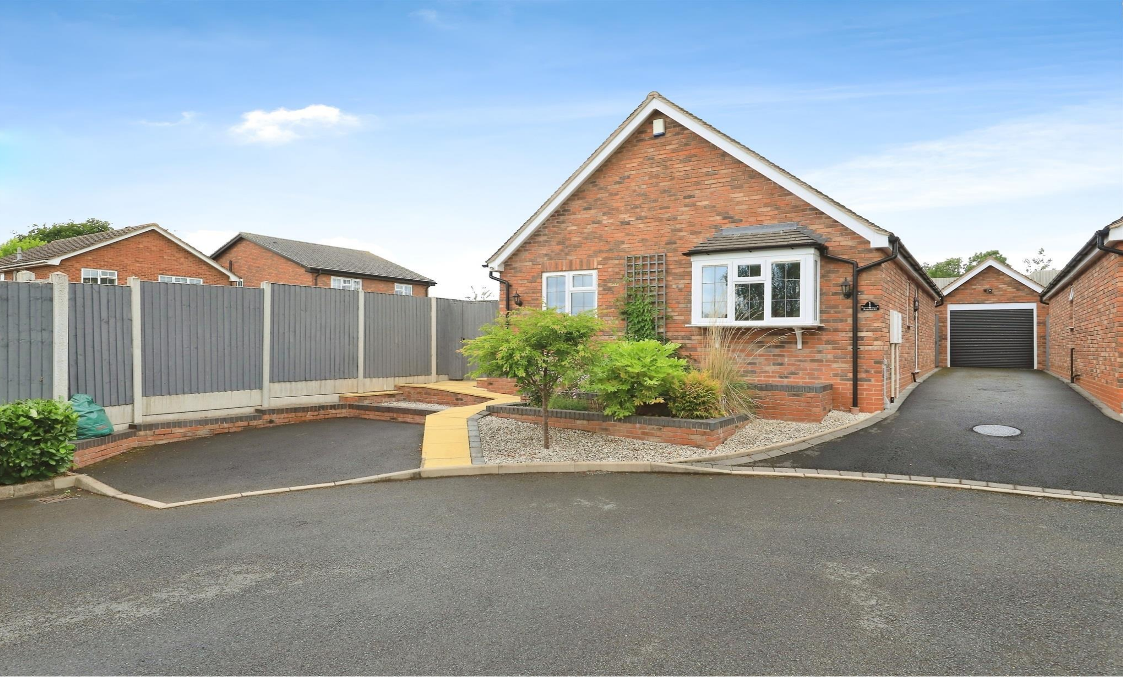
Forest Grange Willowfield Drive, Kidderminster DY11 5AS

Not for marketing purposes. INTERNAL USE ONLY