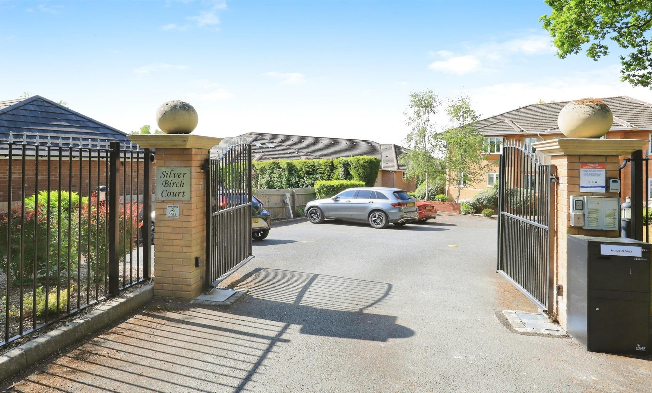
Silver Birch Court Oldnall Road,KIDDERMINSTER DY10 3HD