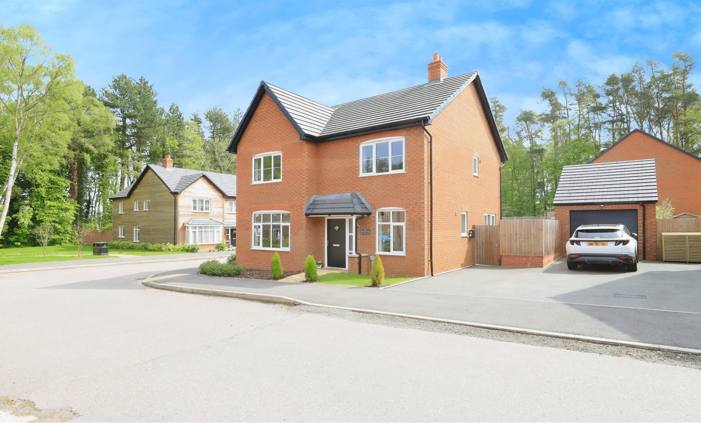
Red Oak Drive, Lea Castle Kidderminster DY10 3GH

Not for marketing purposes INTERNAL USE ONLY