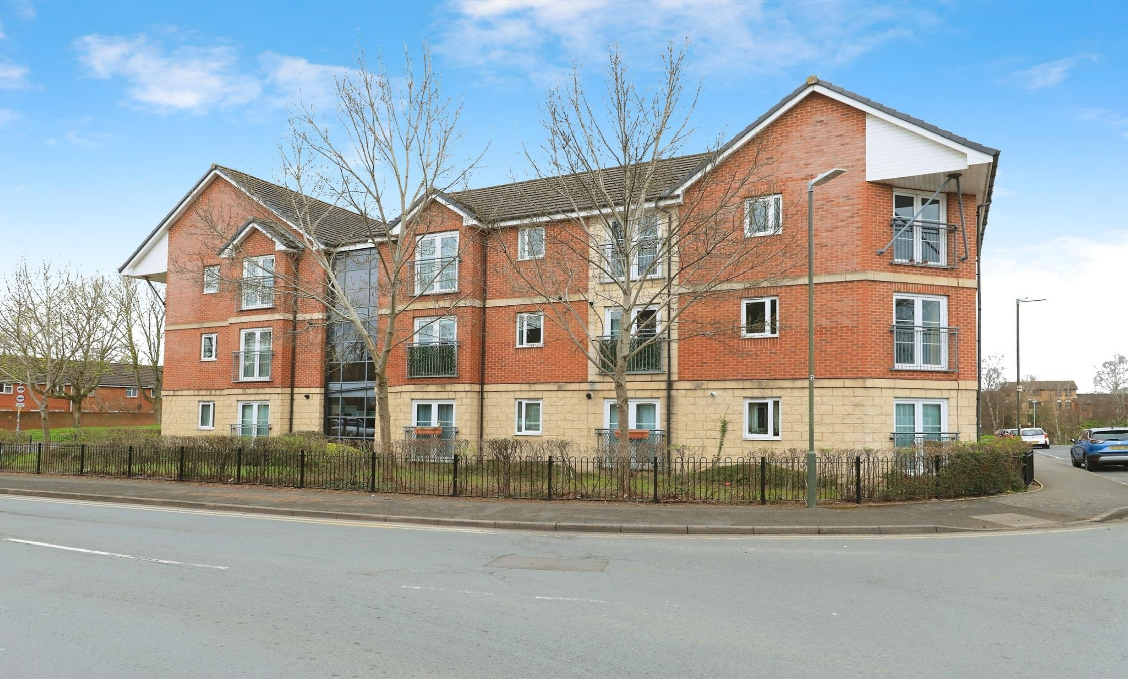
Parkwood Court Park Street, KIDDERMINSTER DY11 6RZ