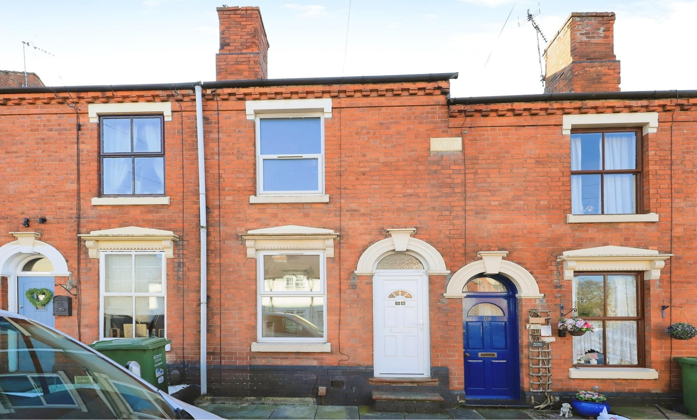
Leswell Lane, Kidderminster DY10 1RN