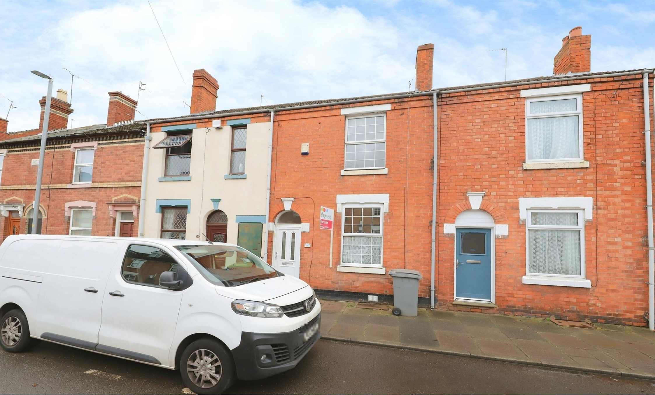
Wood Street, Kidderminster DY11 6UB