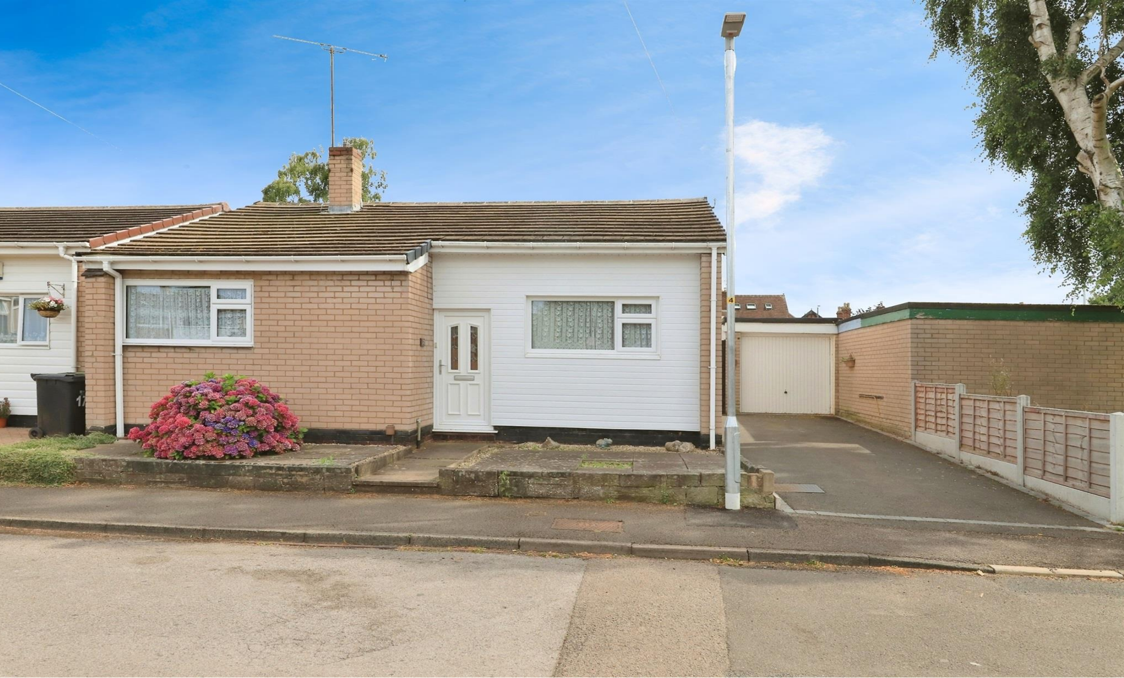
The Patios, Kidderminster DY11 5AB