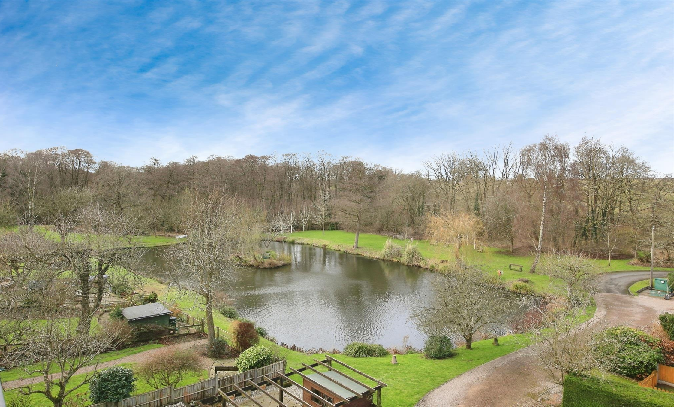
Penstock Court Hurcott Village, KIDDERMINSTER DY10 3PG