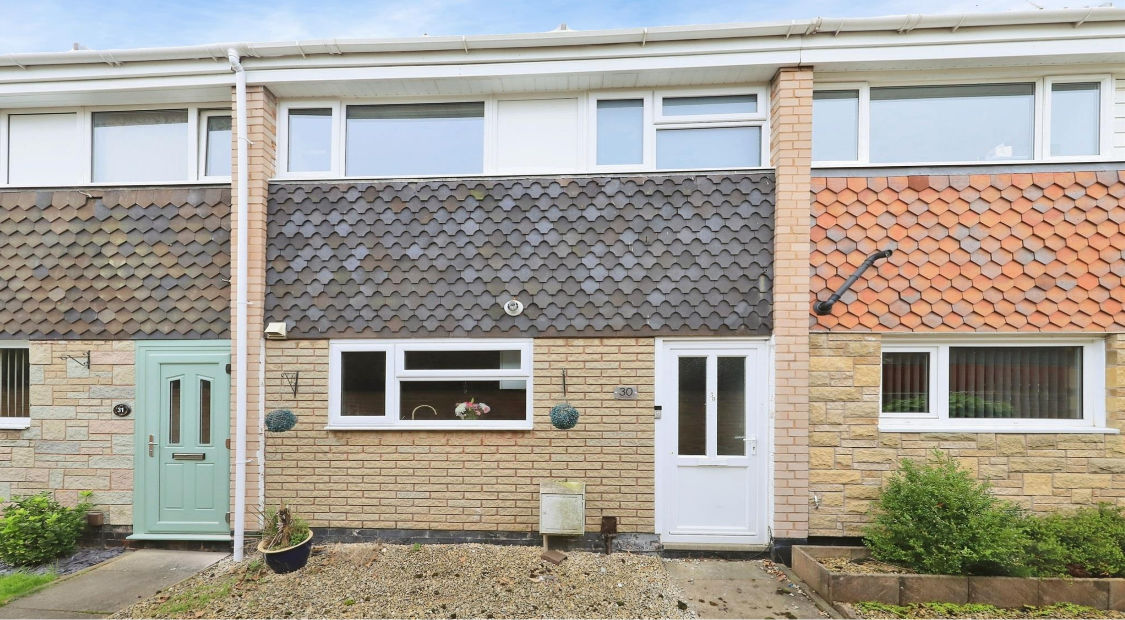
The Patios, Kidderminster DY11 5AB