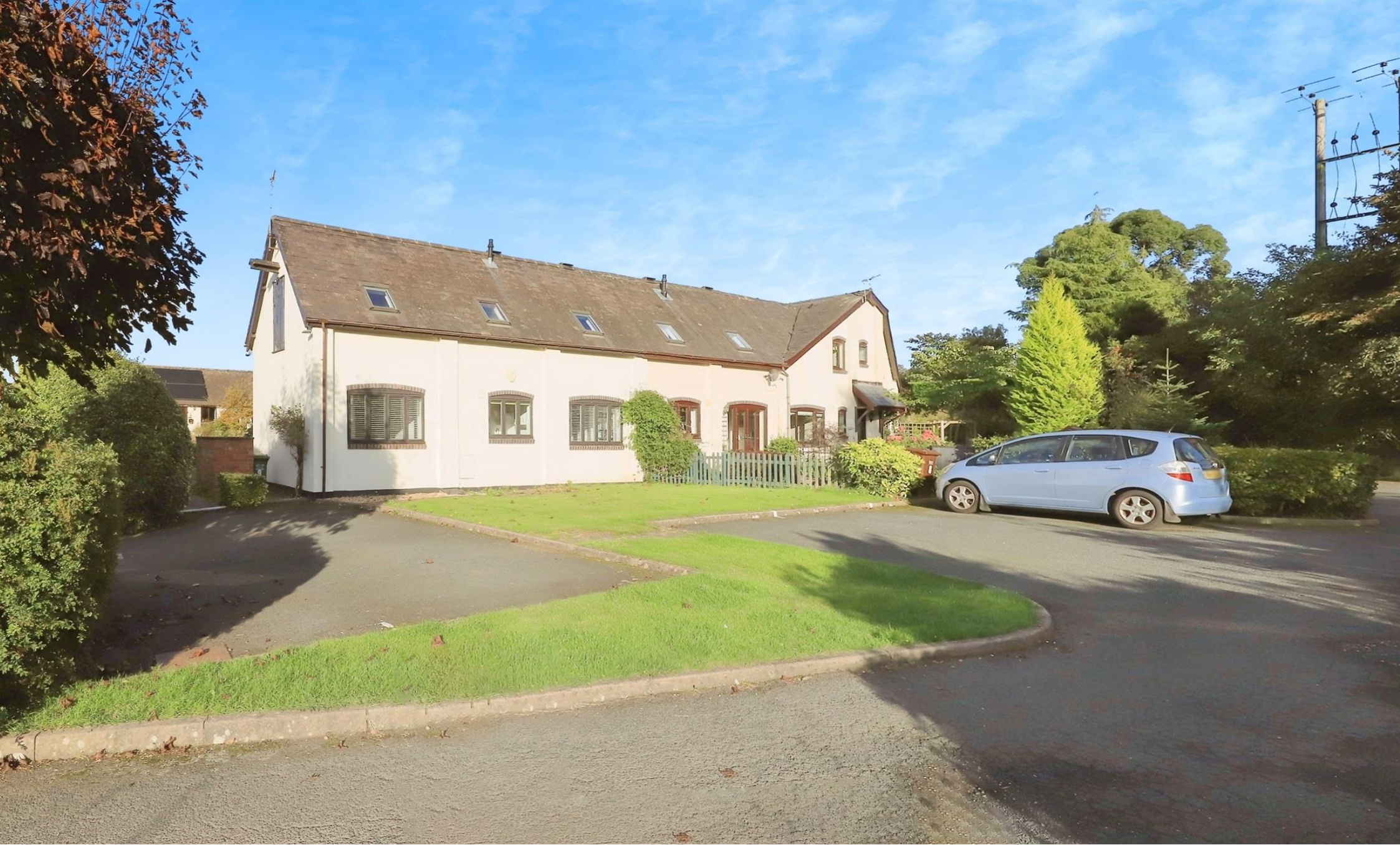
Fold Court The Village, Chaddesley Corbett Kidderminster DY10 4SA