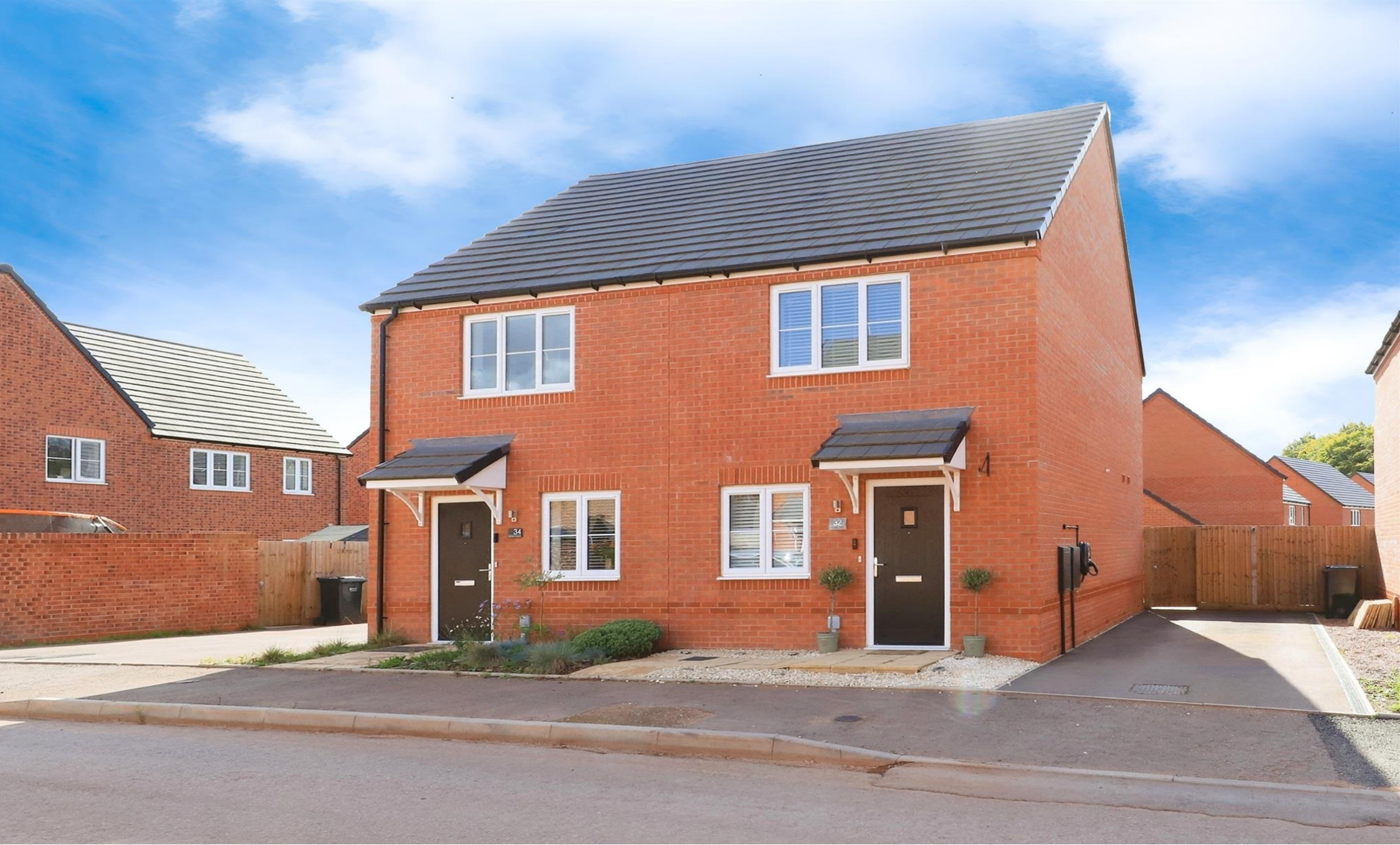
Bluebell Crescent, Lea Castle Kidderminster DY10 3FD