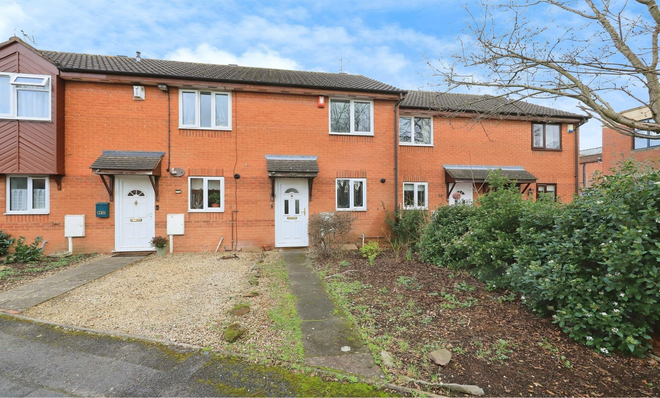
Adams Court, Kidderminster DY10 2SF