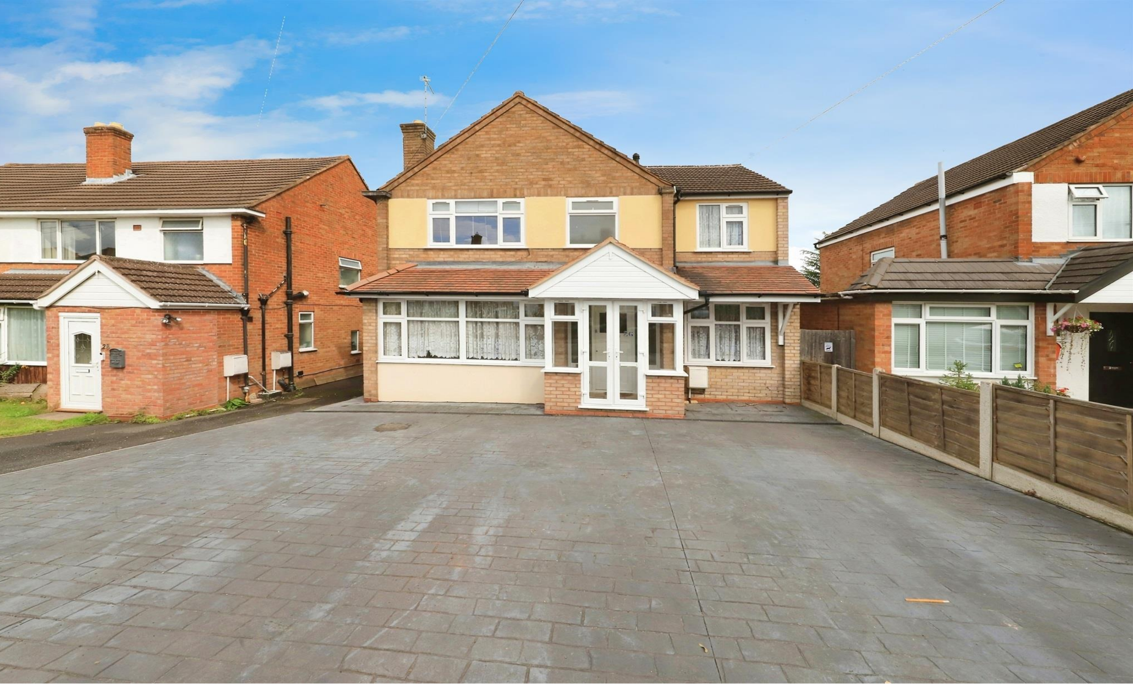
Manor Avenue South, Kidderminster DY11 6DE