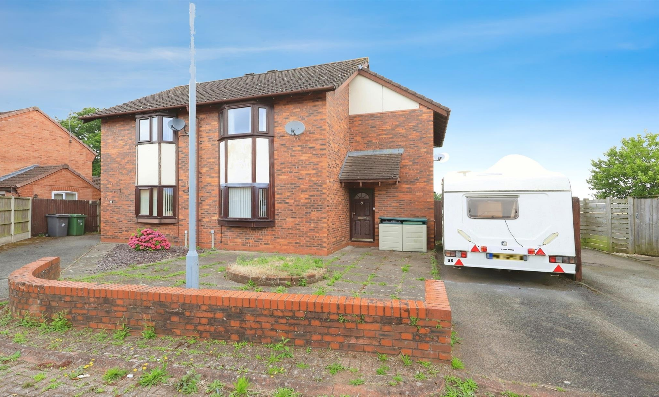
The Slad, Stourport-On-Severn DY13 9JW