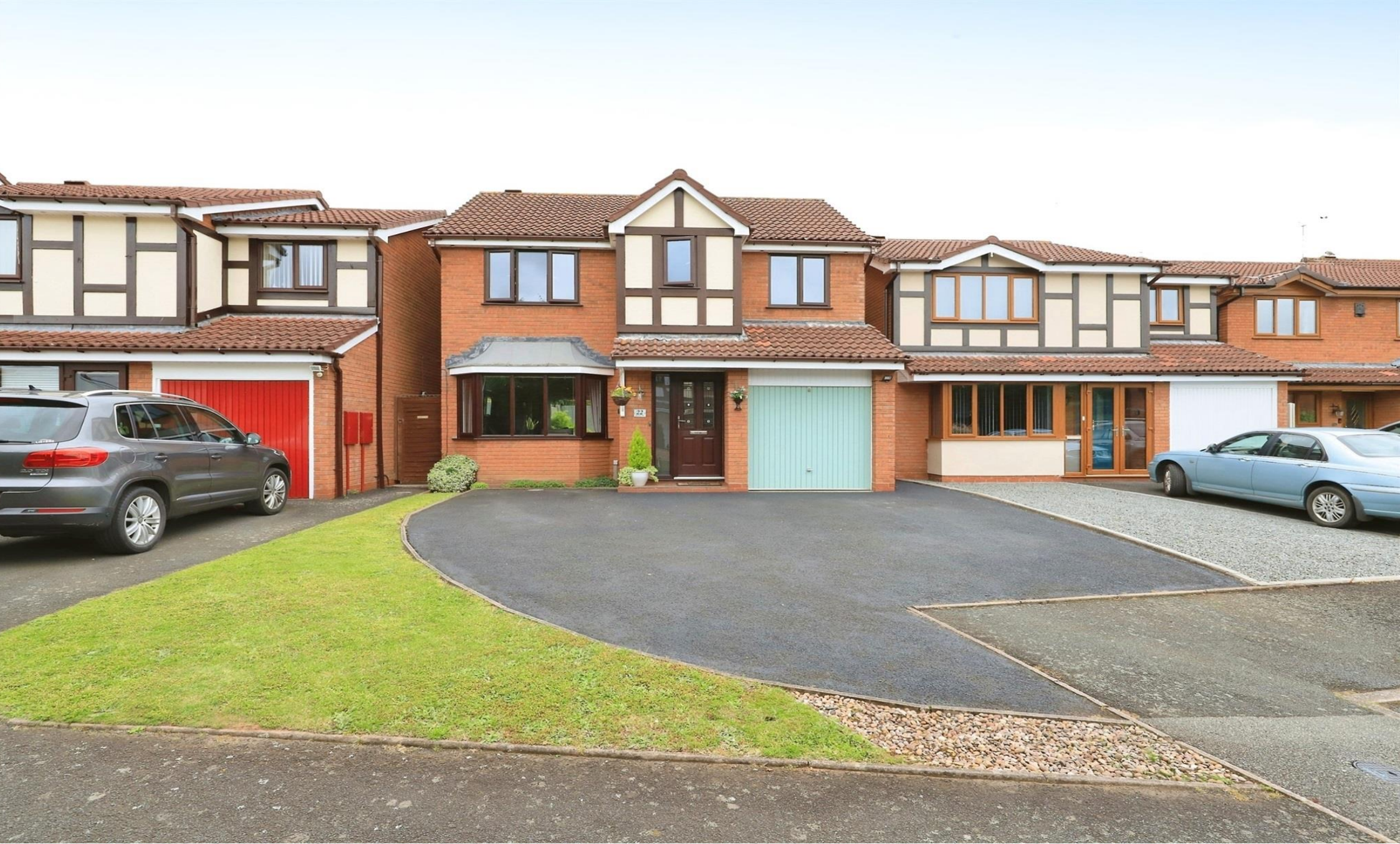
Endeavour Place, STOURPORT-ON-SEVERN DY13 9RL