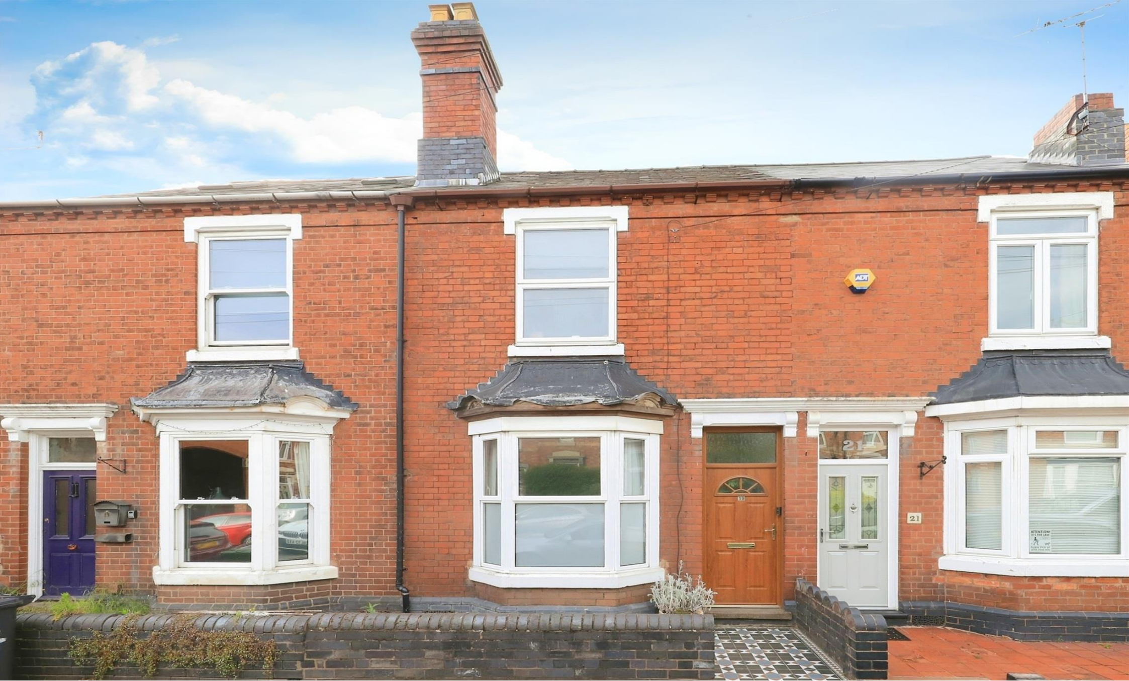
Lea Street, Kidderminster DY10 1SW