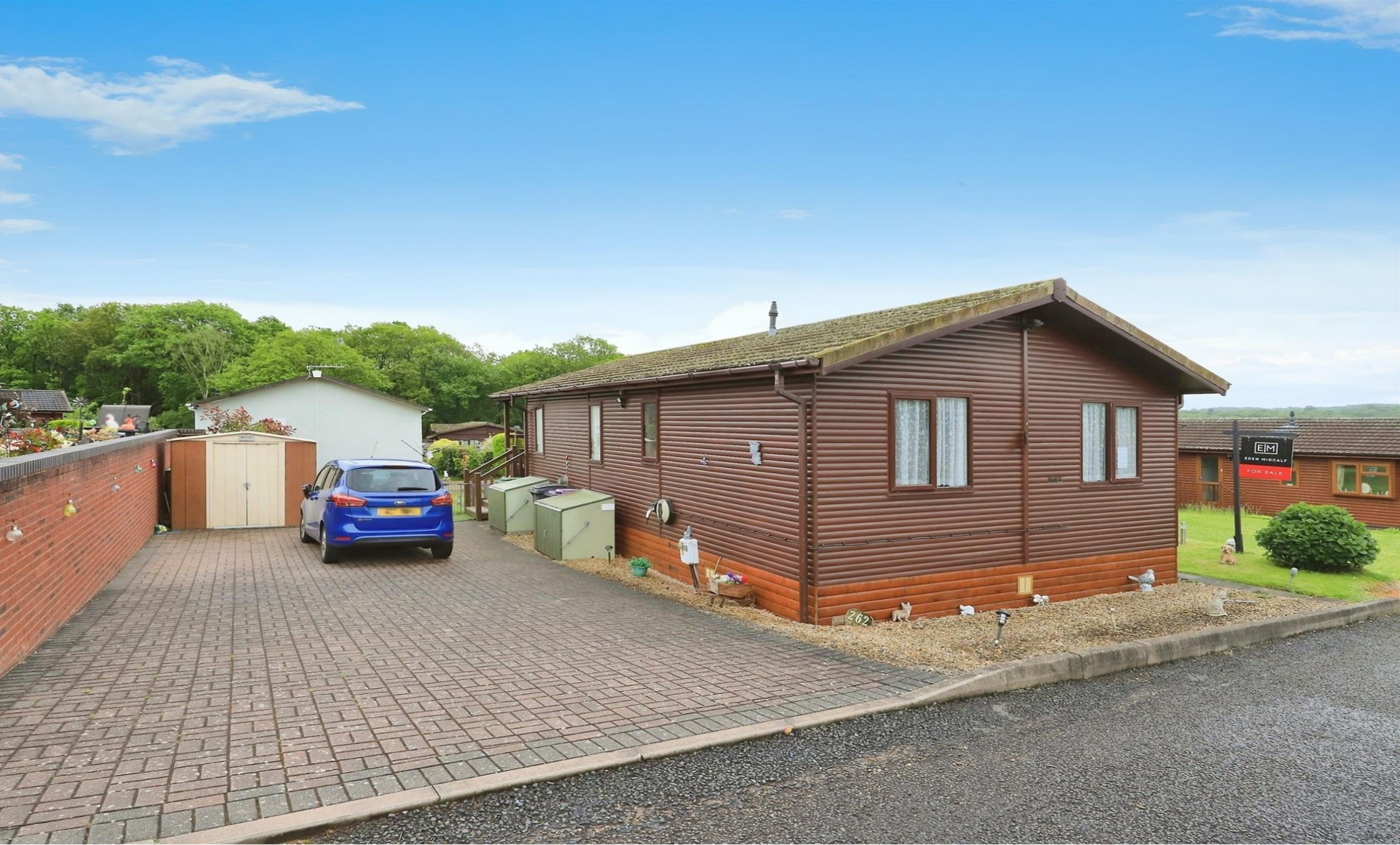
Woodlands Park Homes Dowles Road, Bewdley DY12 3EE