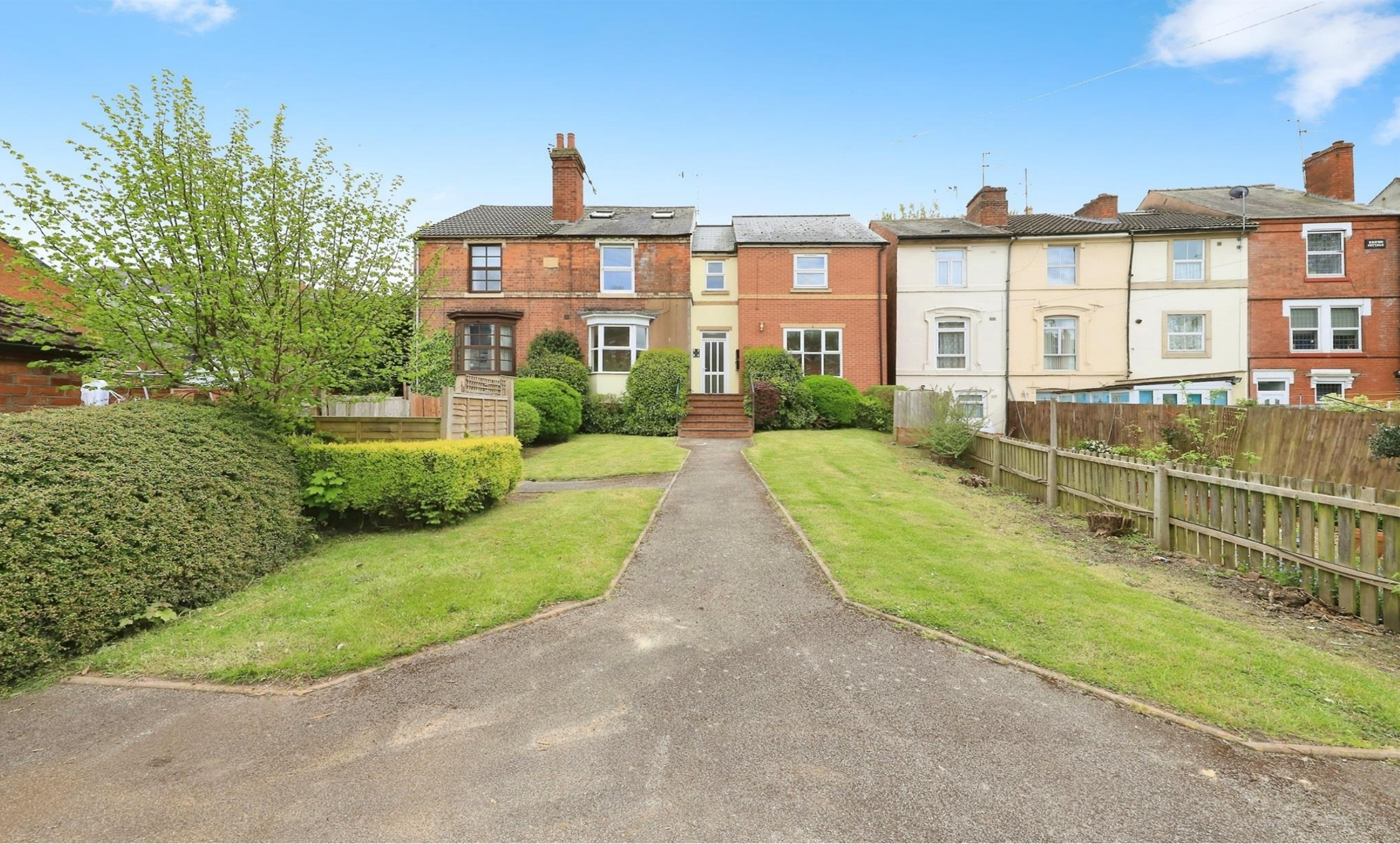
Flat 1 Cherry Orchard, Kidderminster DY10 1SJ