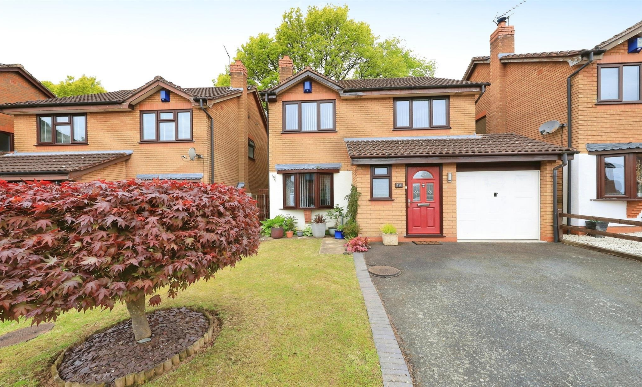
Sutton Park Rise, Kidderminster DY11 7NQ