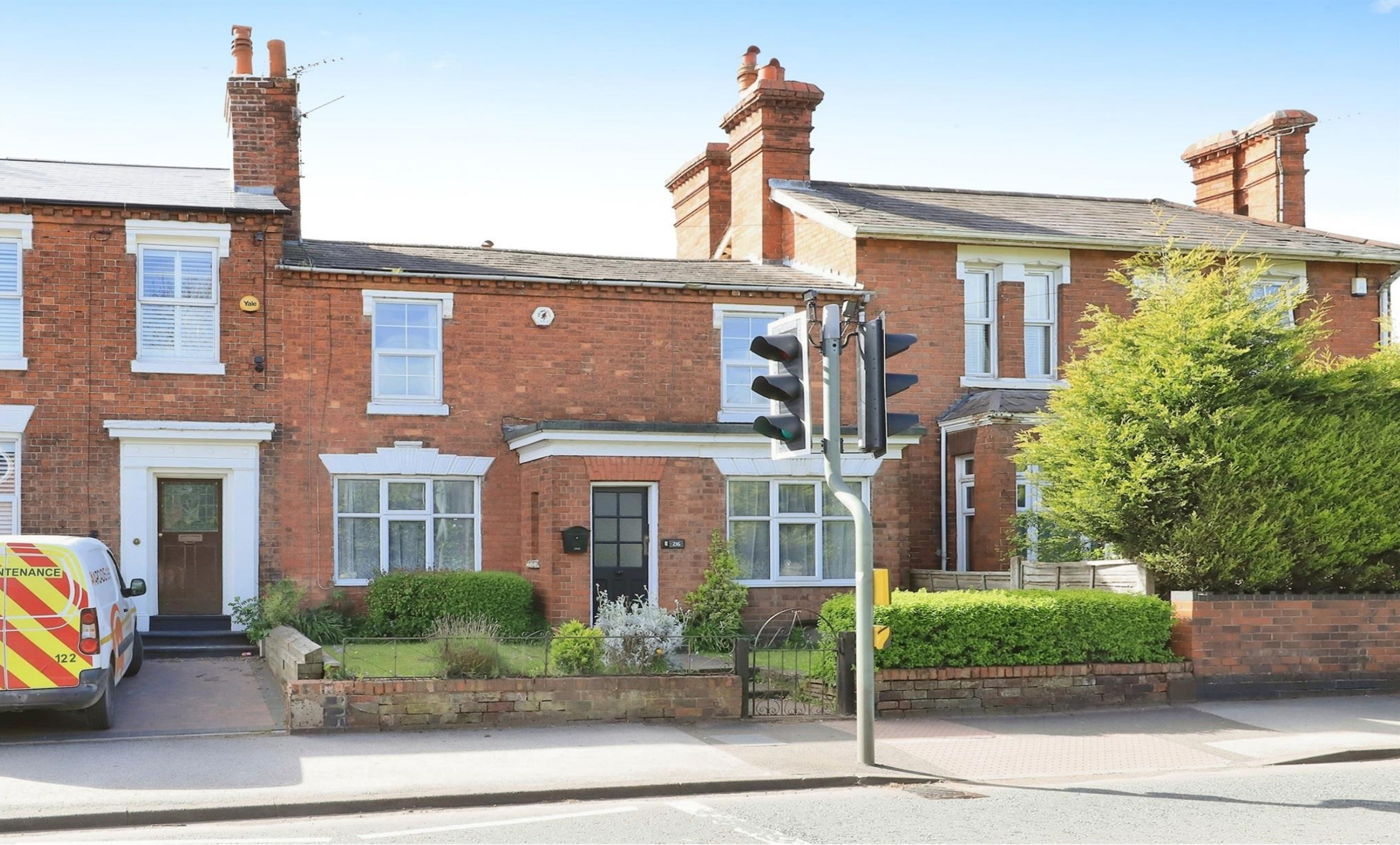
Chester Road North, Kidderminster DY10 1TN