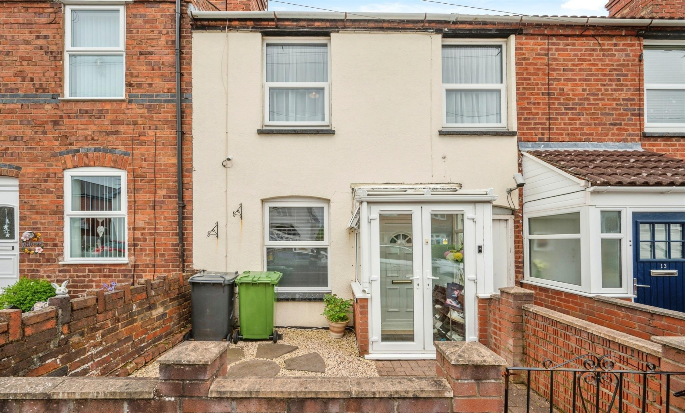
Spencer Street, Kidderminster DY11 6NE