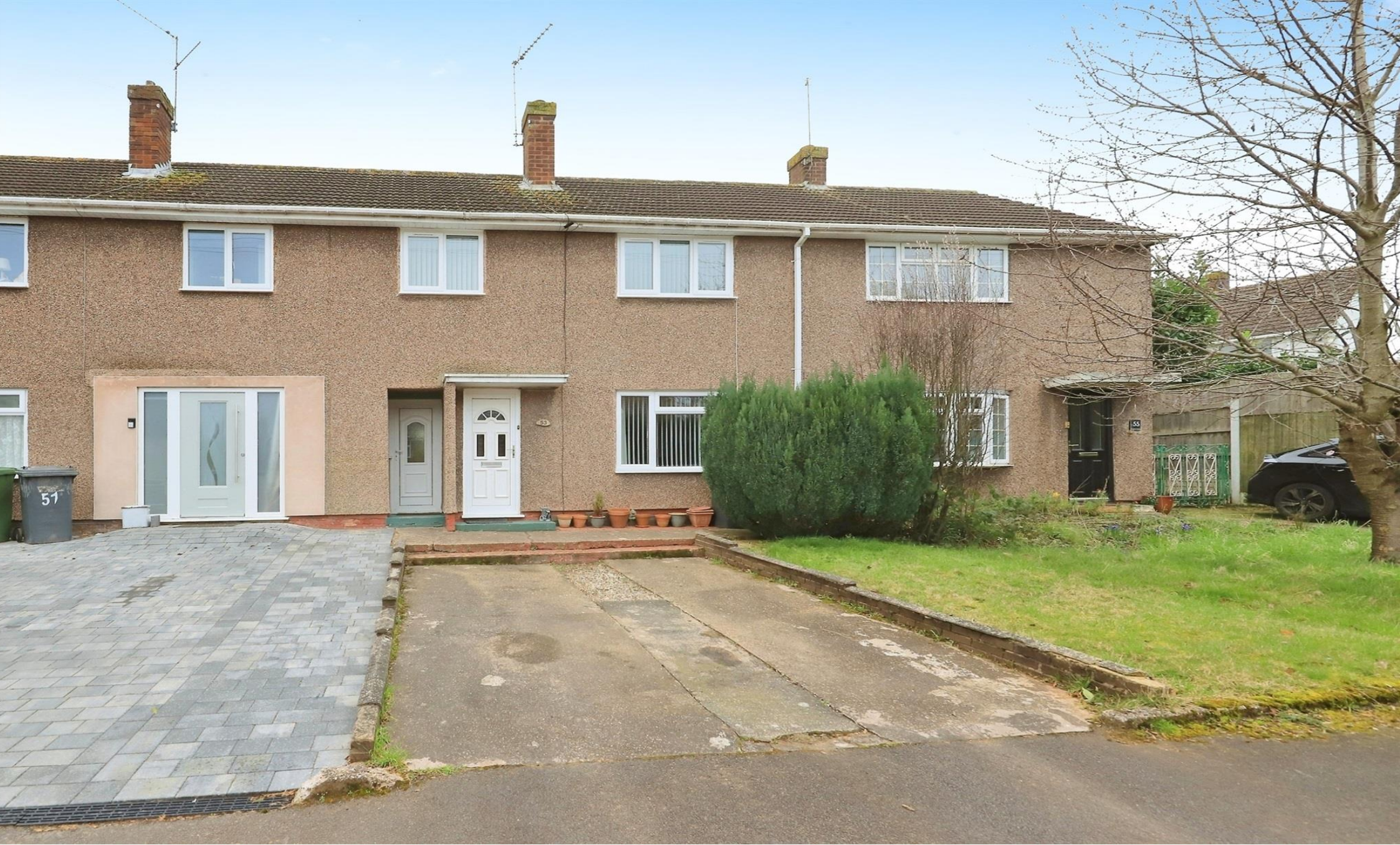
Dunclent Crescent, Kidderminster DY10 3EF

Not for marketing purposes. INTERNAL USE ONLY