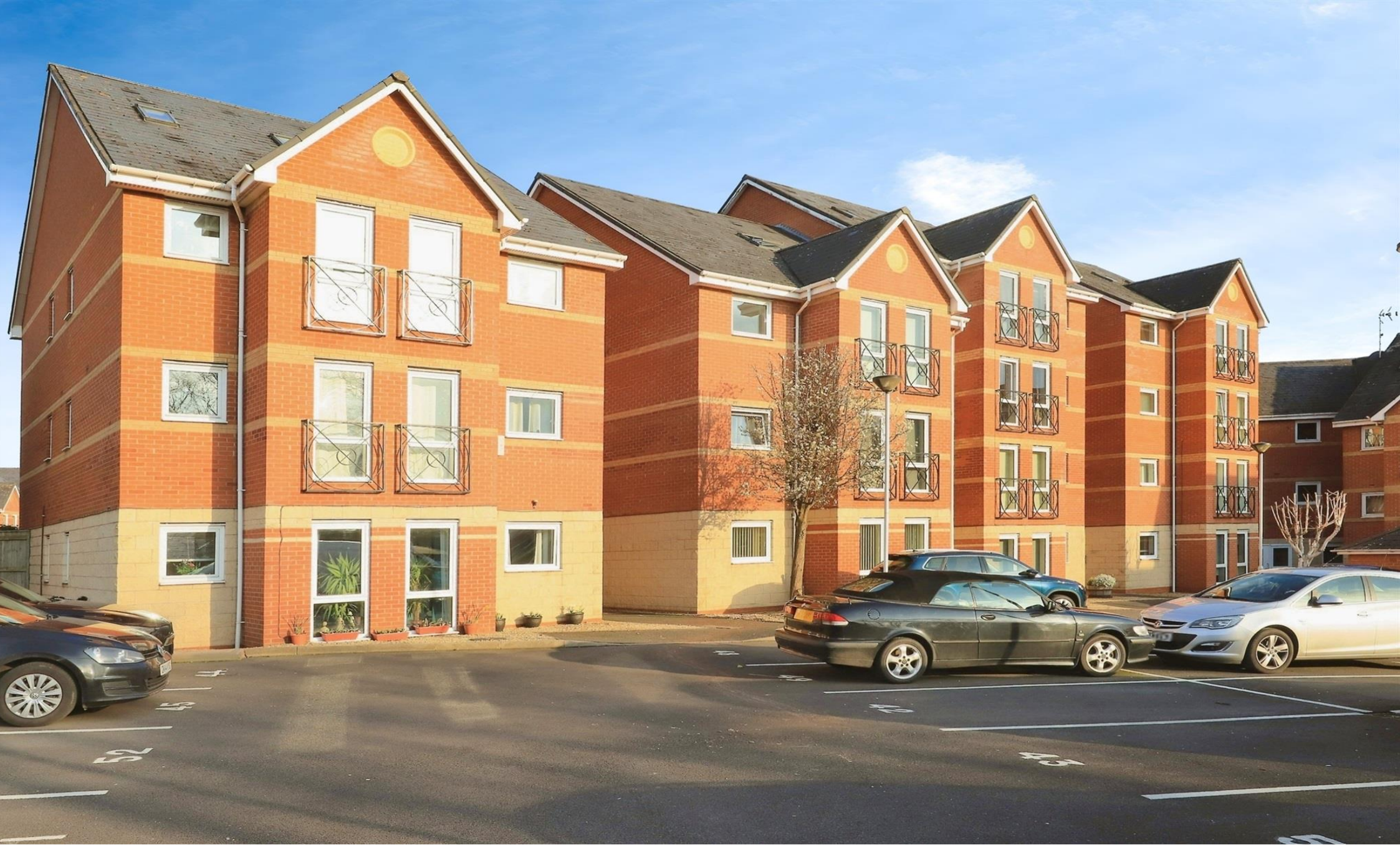
Forge Court St. Michaels Close, Stourport-On-Severn DY13 8EA