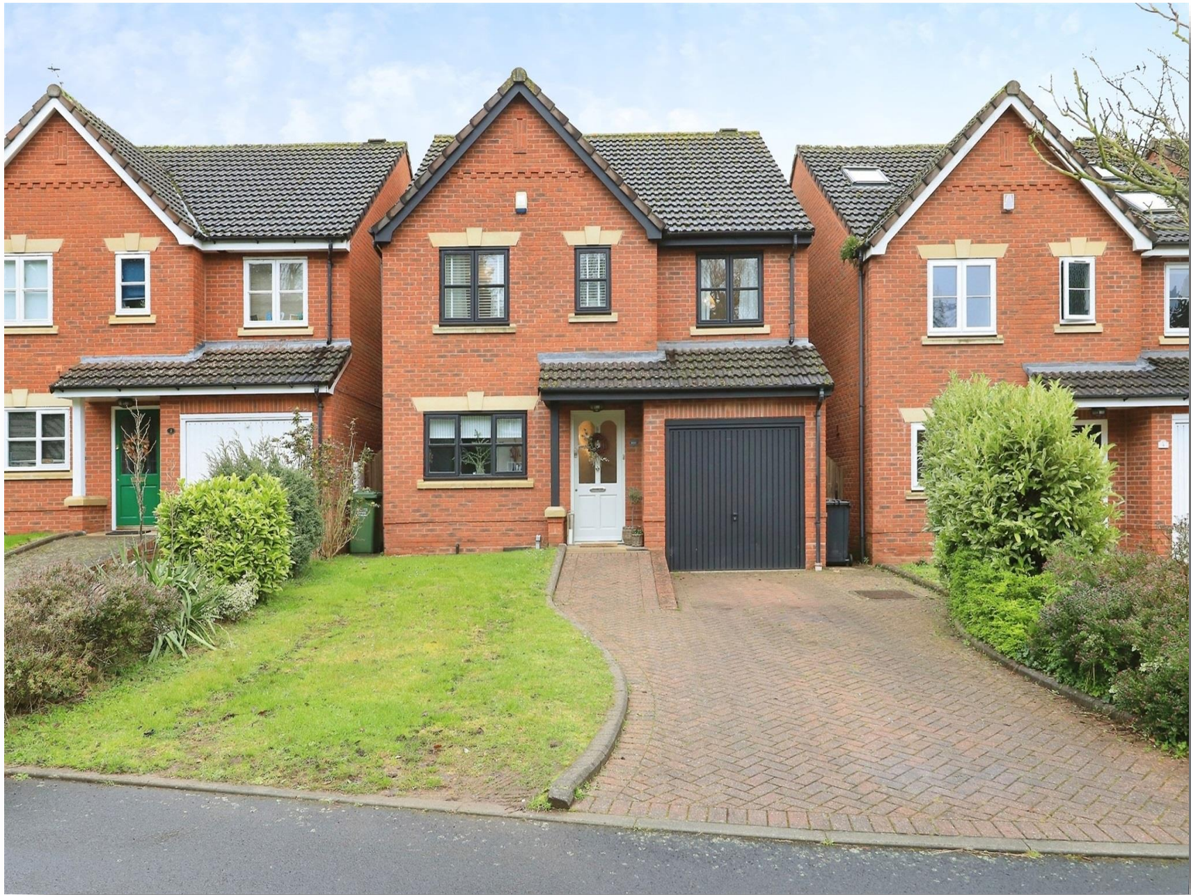
Comberton Gardens, Kidderminster DY10 3DB