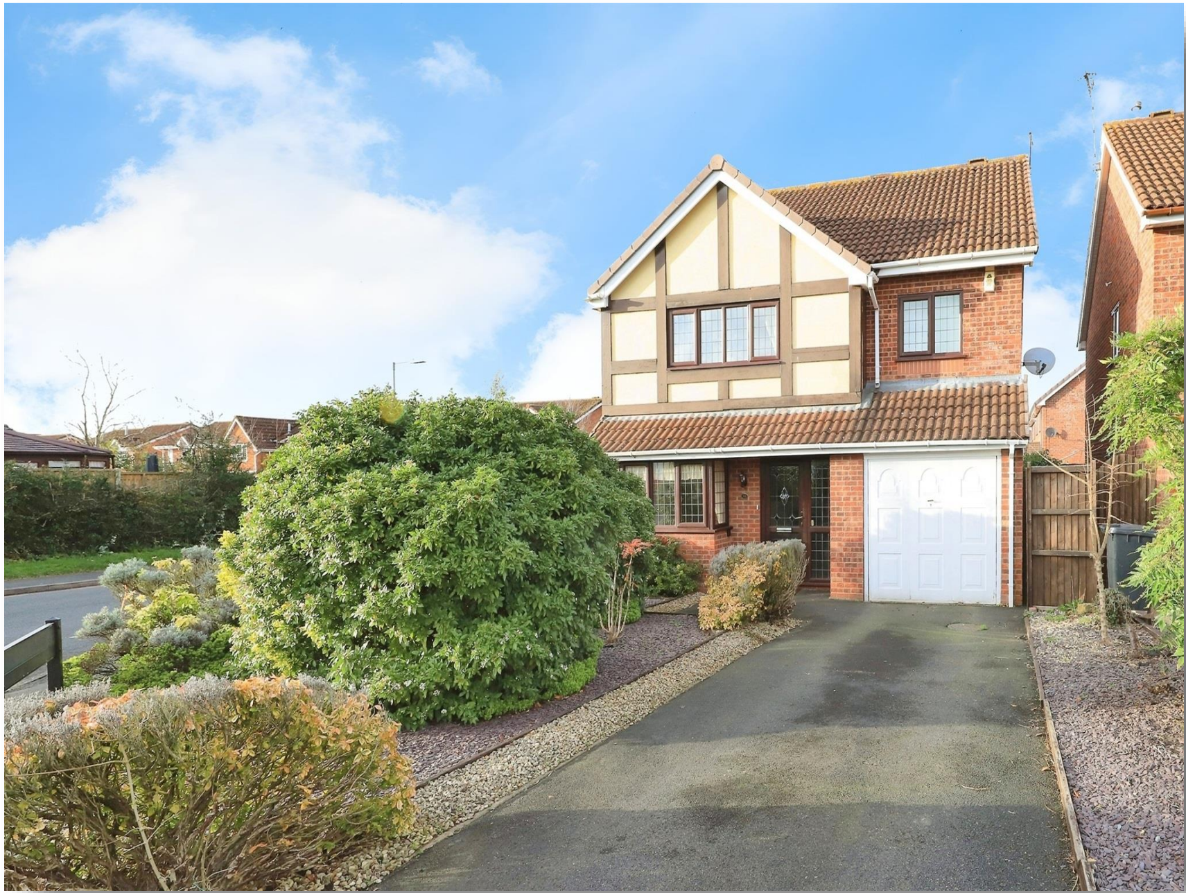
Cutty Sark Drive, Stourport-On-Severn DY13 9RP