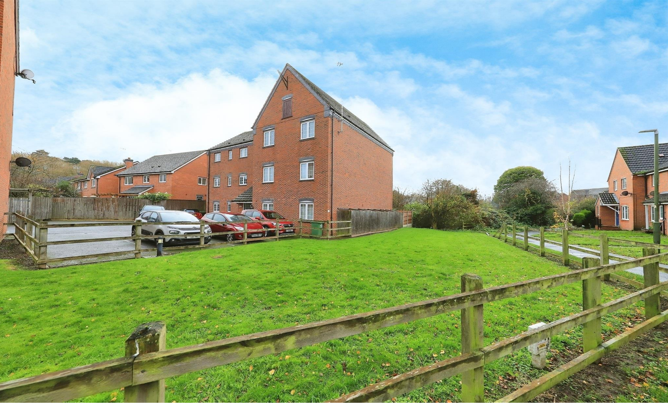
Stockton House Evergreen Way, Stourport-On-Severn DY13 9GJ