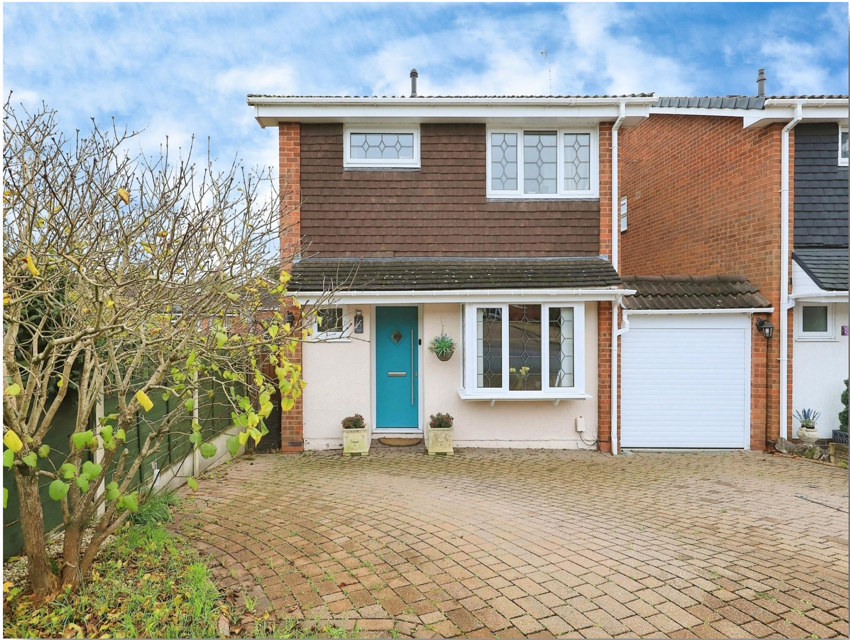
Pineridge Drive, Kidderminster DY11 6BG