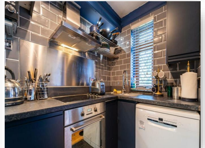
Lea Yield Close, Birmingham B30 2LZ