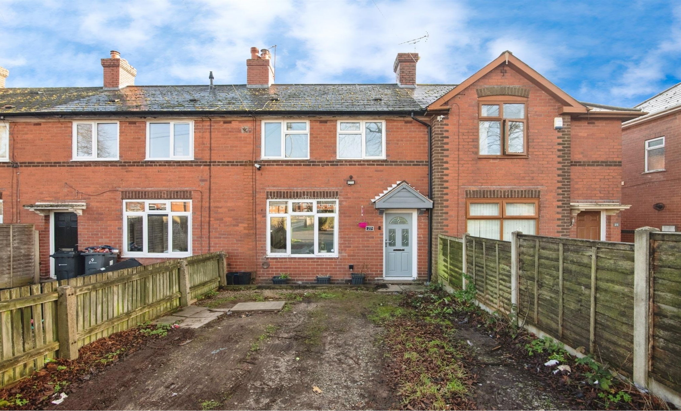
Wasdale Road, Birmingham B31 1QH

Not for marketing purposes INTERNAL USE ONLY