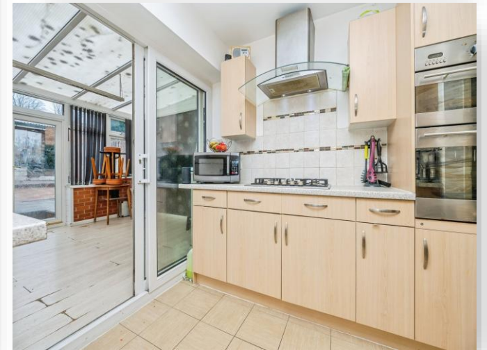
Silverton Crescent, BIRMINGHAM B13 9NH