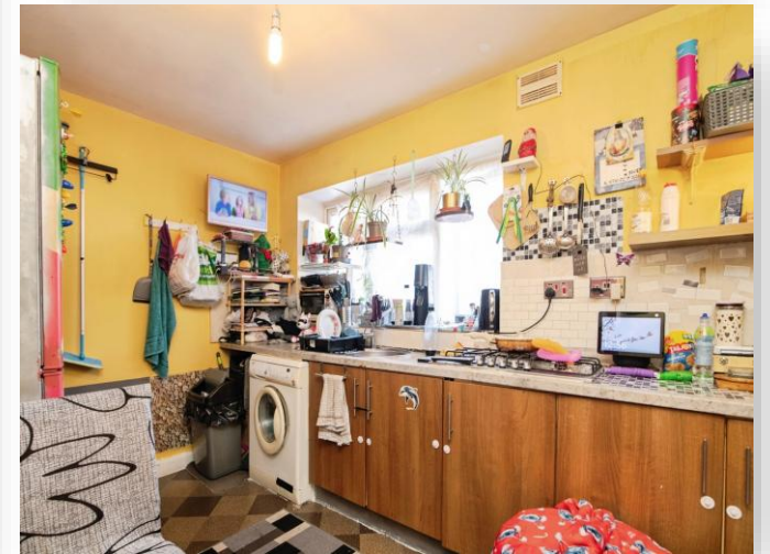
Edgbaston Road, Smethwick B66 4LF