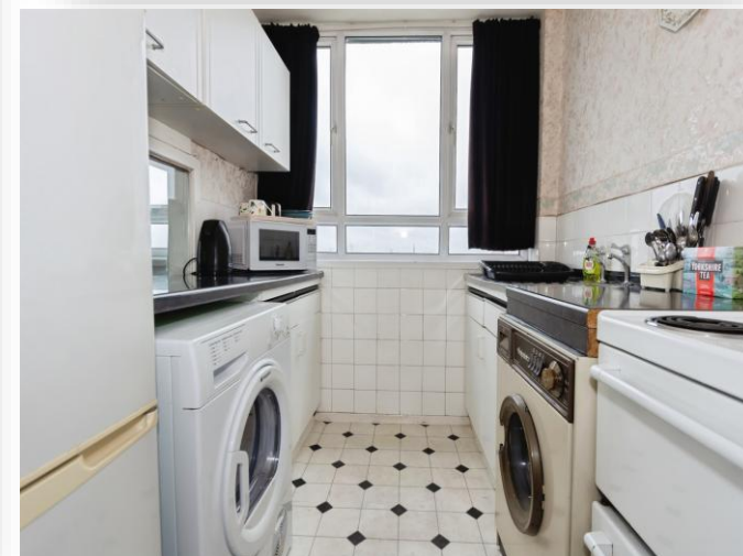
Elmwood Court Pershore Road, Birmingham B5 7PE