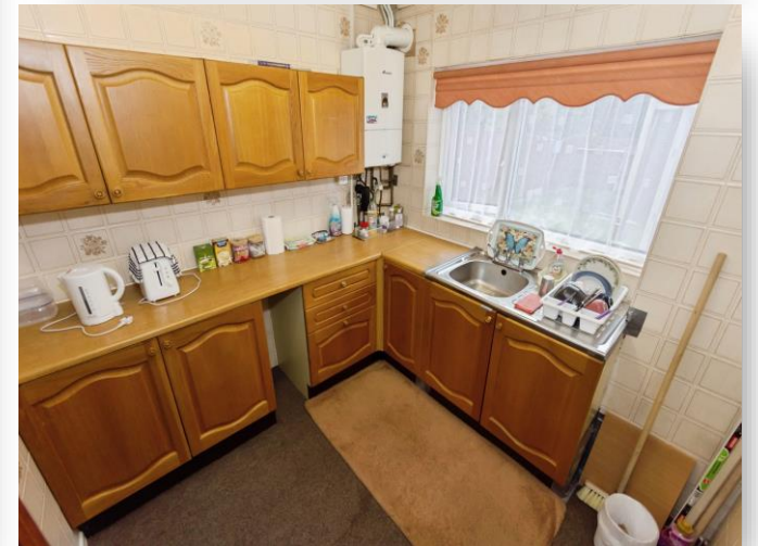
Romsley Road, Birmingham B32 3PR