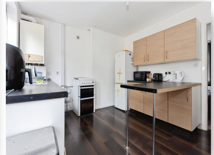
Bodenham Road, Oldbury B68 0SG