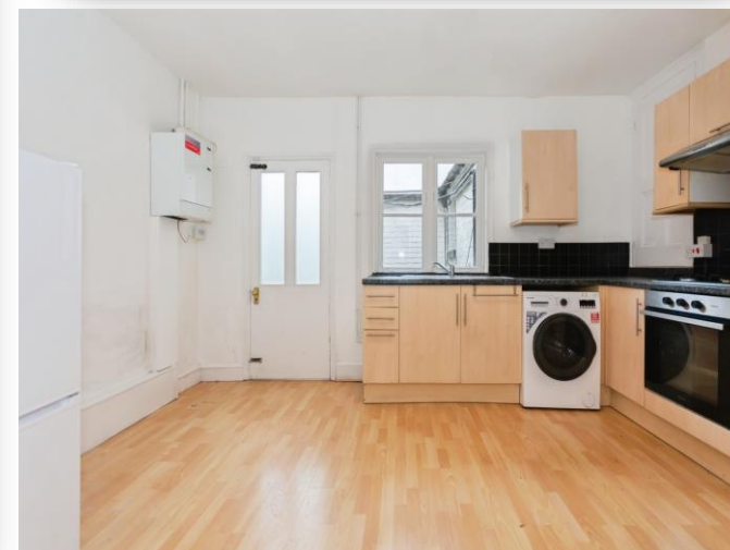
Old Church Road, Harborne Birmingham B17 0BB