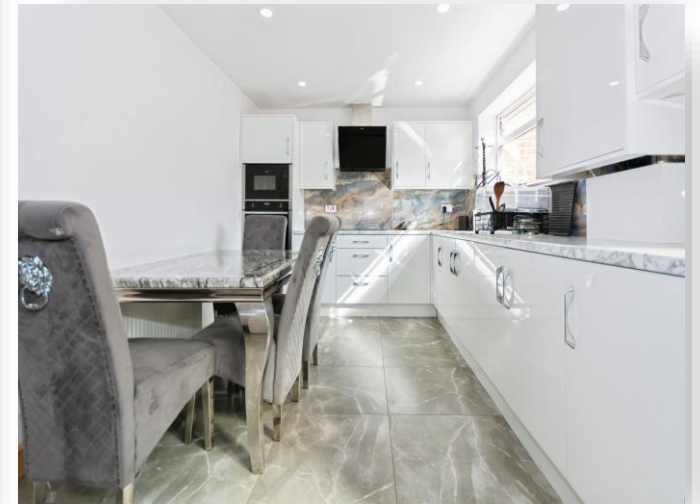
Cadleigh Gardens, Birmingham B17 0QB