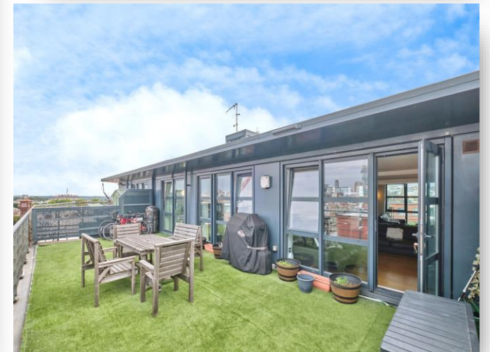
Abacus Building Alcester Street, Birmingham B12 0NX