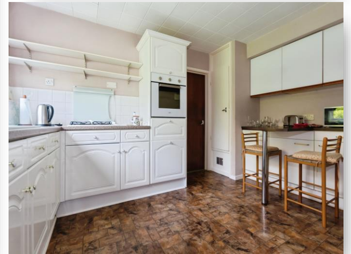
Augustus Road, Birmingham B15 3NB