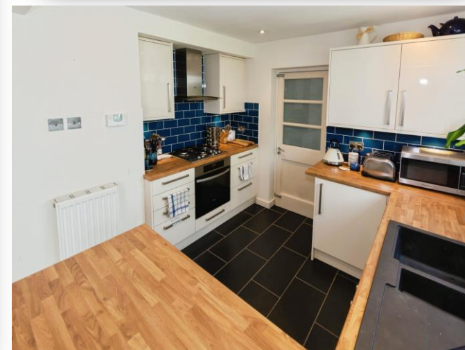
Ferncliffe Road, BIRMINGHAM B17 0QH