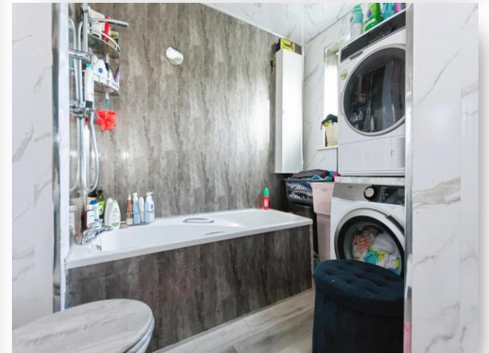
Barleycorn Drive, Birmingham B16 0NA